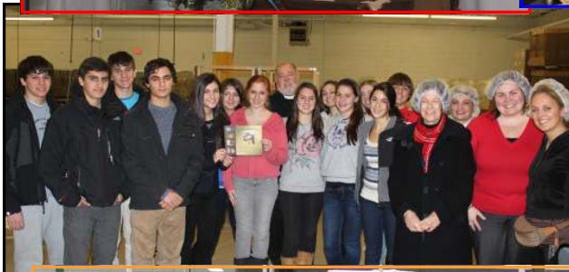
Moving clockwise from top left: Gabriel announces the birth of Jesus in the Christmas Pageant; our Youth Groups' visit to the Nursing Home in Wheeling; Sunday Church School children sing for us during the Pageant; Joy/Jr. Goyans sort food for the Thanksgiving baskets; our amazingly fun Parish Family Ice Skating and Pizza Party; our Goya at "Feed My Starving Children" in Schaumburg (the hair nets were a nice touch - learn more at www.fmsc.org .)