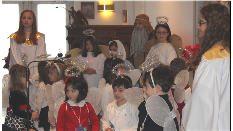
"Our little angels" gather around baby Jesus as portrayed in this past year's Christmas Pageant. "BRAVO" to all (children, young adults and adults) for a job well done!

Long before the publishing of the H.G. Wells novel and long before that infamous 1938 broadcast, a real "War of the Worlds" was initiated among the people of the world that began many years earlier - during the time of Christ. Just prior to Jesus' departure to Galilee, our Lord was in the wilderness preparing Himself for His Ministry. It was at that time that Jesus was tempted by Satan and offered to rule over the earthly Kingdoms of "THIS" world, as long as He paid homage to Satan and denied God. Christ spoke firmly and said: "Away with you, Satan! For it is written. 'You shall worship the Lord your God and Him only you shall serve'."