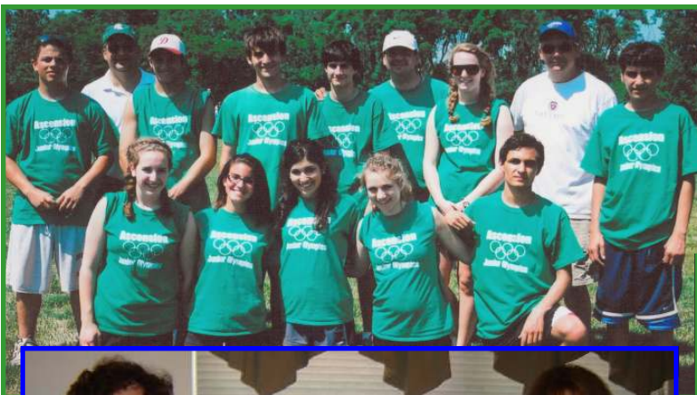
(At left and below): Our Jr. Olympics softball team and our three bowling teams, pictured with their respective coaches.

Contact: hanagnos@att.net or (847) 612-3030