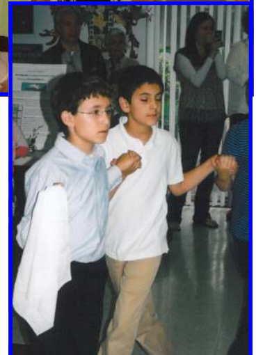
Our Greek School presented a wonderful program to conclude the year. It included poems, songs and Greek dancing. We thank our dedicated teachers for an excellent year and for all they do to teach our children the Greek language and about our Greek culture.