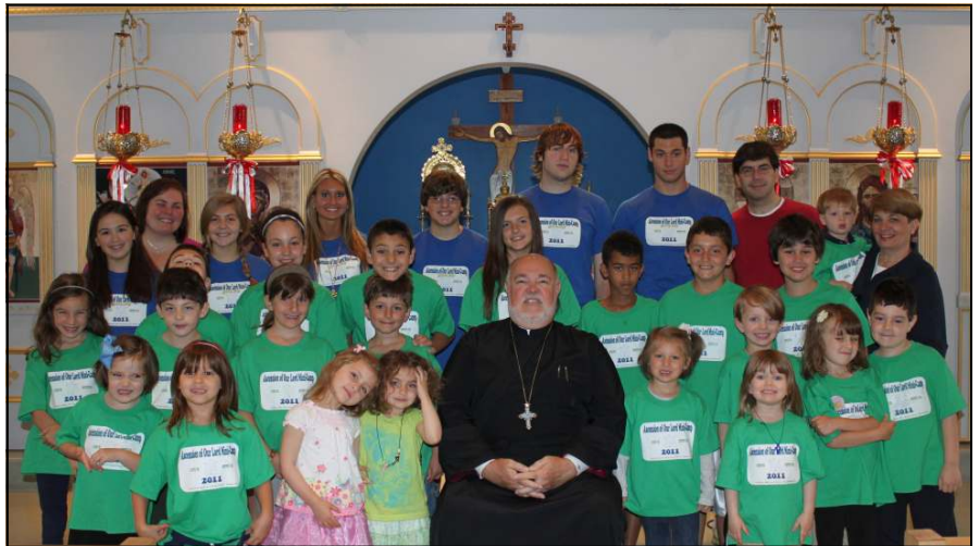
Mini Camp 2011 was a great success! Thanks to all those who attended and assisted with the program, as pictured above. See more pictures on page 5.

In preparation for this piece, I was studying the reading from the Epistle Lesson of St. Paul to the Romans 12:6-14. Paul was known by many and had a particular reputation