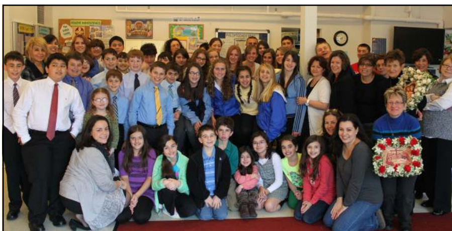
Many parishioners gathered on Holy Friday to prepare our Church for Holy Friday and Pascha. This included, among other things, decorating the Kouvouklion, wrapping Easter eggs and cleaning the Church. We thank those who offered their time and talents and also those who provided the Lenten meal. More pictures from Holy Week and Pascha on page 3.

In the nearly three years that Christ's Disciples spent with Jesus, in spite of the teachings they heard and miracles they witnessed in His presence, they could not fully understand Him. Christ was on His way to Jerusalem for the last time. As God, He knew every detail of what was about to happen, For Christ foretold that in Jerusalem, the Son of Man would be arrested and tried by the Judaic and Roman authorities. He would be subject to public humiliations; He would be crucified,