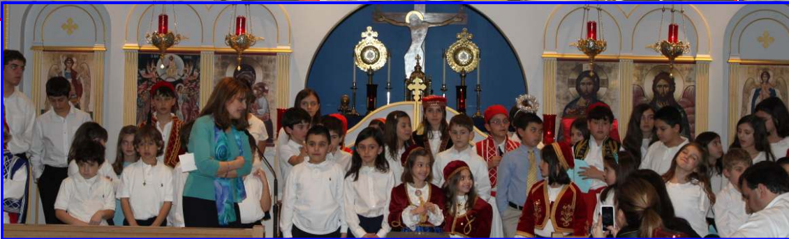
From Καθαρά Δευτέρα (Clean Monday) to Pascha.