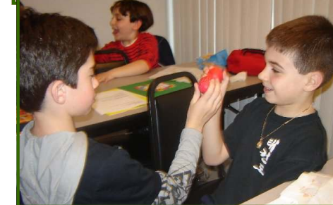
(Top left): The Greek School Children get a taste of traditional Lenten food for Clean Monday and also a lesson in making taramosalata.