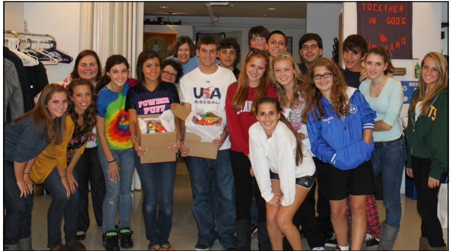
Our Goyans packed and sent 17 care packages to our Ascension College Freshmen. We thank the Goyans for the bags and bags of food and snacks they brought. Great job!

When we read about the Parable of the Sower and see how different ways seed may or may not take hold in its environment and how the seed that is planted in fertile soil is the only seed planted that actually yields good fruits - we learn from this beautiful story the valuable lesson of how we can become sowers who plant good seeds - within our family and within our lives as Christians. The parents of this young man obviously had the seed of God's Word planted within them from their early Christian roots, which eventually led them to