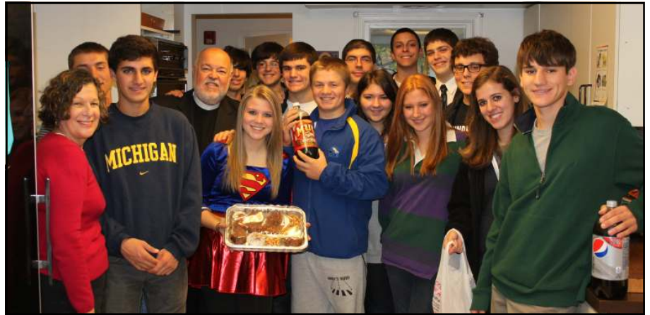
On October 30th, our Goyans prepared and delivered a meal to the PADS "Safe Haven" for homeless women. Goyans helped by donating food/toiletry items and/or preparing/delivering the meal. "Delivery group" is pictured above with more pictures on page 7.

In a feeble attempt to share my sick sense of humor,