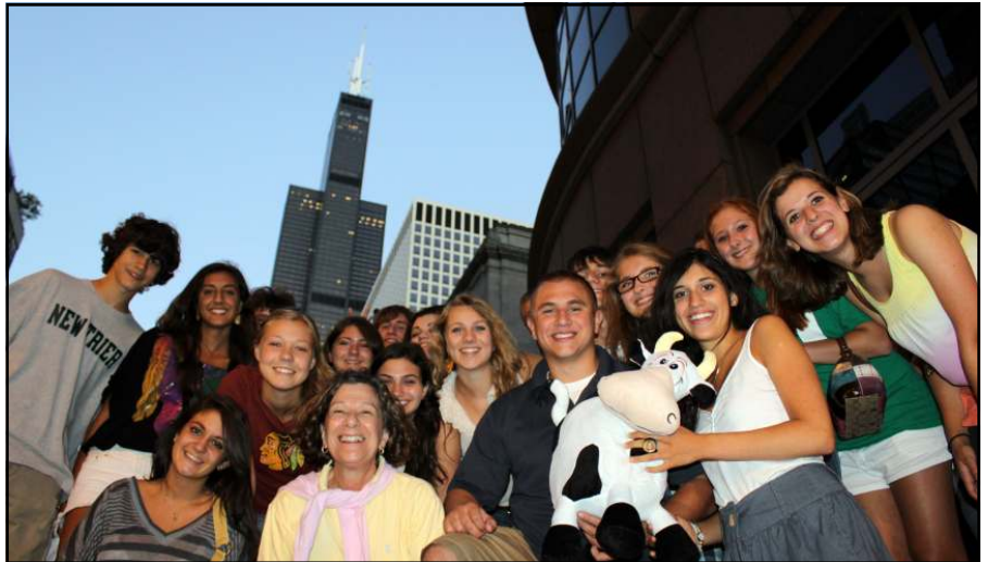
The Goyans had another great time on their annual trip to Downtown Chicago as pictured in their traditional group photo in front of the "Sears" Tower.